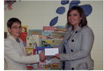
St. Paul's Lutheran Church Presents a cheque for $2,400

We also appreciate the assistance of friends, respite providers and families who lent their help at various events throughout the year.