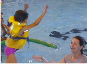
Respite time is rewarding for the child, the family and the caregiver.