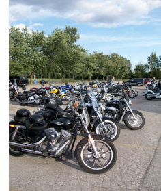
Once again, Robert's Ride was a very successful event for families and riders.