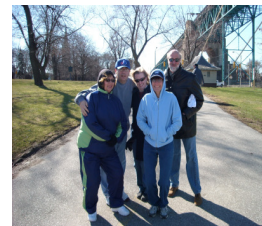
People rode, walked and ran at the Ambulance Chaser Run organized by the U of W Law Students Society.