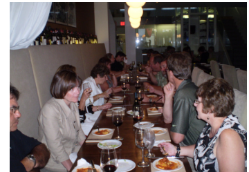
Over 200 people "wined and dined" on Erie St. at our 9th Annual Walk on Erie.